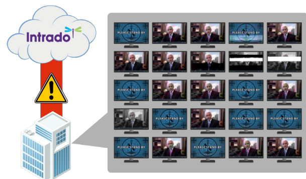
Video streaming across your firewall can create network congestion, resulting in a poor quality viewing experience.